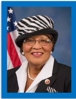
Alma S. Adams, Chair

Wages and hours of workers, including but not limited to the Davis-Bacon Act , the Walsh-Healey Act , the Service Contract Act , and the Fair Labor Standards Act ; workers' compensation, including but not limited to the Federal Employees' Compensation Act , the Longshore and Harbor Workers' Compensation Act , and the Black Lung Benefits Act ; the Migrant and Seasonal Agricultural Worker Protection Act ; the Family and Medical Leave Act ; the Worker Adjustment and Retraining Notification Act ; the Employee Polygraph Protection Act of 1988 ; trade, international labor rights, and immigration issues as they affect employers and workers; and workers' safety and health, including but not limited to occupational safety and health, mine safety and health, and migrant and agricultural worker safety and health.