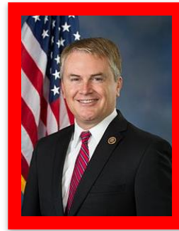
James Comer, Ranking Member

Raúl M. Grijalva Marcia L. Fudge Kim Schrier Jahana Hayes David J. Trone Susie Lee