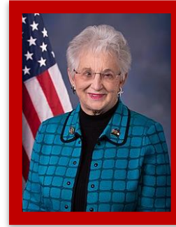
Virginia Foxx (NC-05), Ranking Member